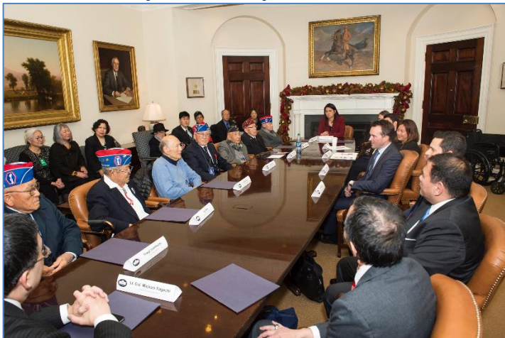
Washington D.C. (December 16, 2016) – Seven Japanese American World War II Veterans along with the National Veterans Network, met with the United States Secretary of the Army, Eric Fanning on December 15, 2016.

In a closed-door meeting, veterans of the 100th Infantry Battalion, 442 nd Regimental Combat Team, and Military Intelligence Service (100 th /442 nd /MIS) freely spoke with the Secretary sharing their military experiences during WWII.