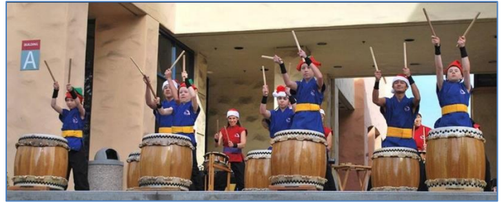
Our youth drummers at the Multicultural Festival. Happy Holidays to one and to all!