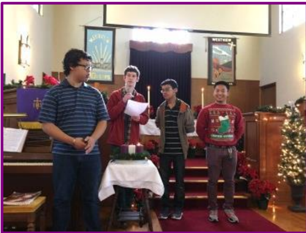
Photo: Our youth and youth adults leading the advent candle lighting during worship service.

The last Revelation Study on Max Lucado's book will be on January 18th (not the 11th), 6:30 pm at Westview .