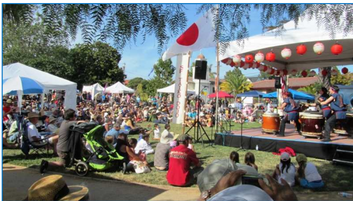
Taiko is always entertaining and will draw a large crowd. Pictured above is the San Francisco Taiko!