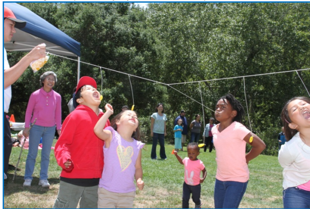
Above: yellow koko eating race. Below: the racers.

Children and adults (grandparents, too) will have great fun with the variety of races—sack race, hashi (chopstick) contest, koko race, two-person geta race, powdered donut race, and others. There’s a water balloon toss contest and a jan ken pon (“rock, paper, scissors”) contest, too!