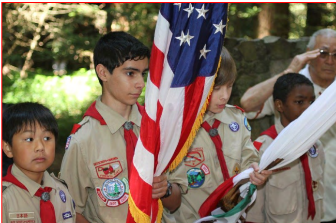
Berekeley Boy Scout Troop #24 posted the colors.

The wonderful "Band of the West," members of this Sea Cadets unit are high school students from around the SF Bay region, played a number of military and patriotic music to the delight of all. Over 100 friends and family members were in attendance.