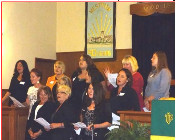
Teen Challenge Women singing.