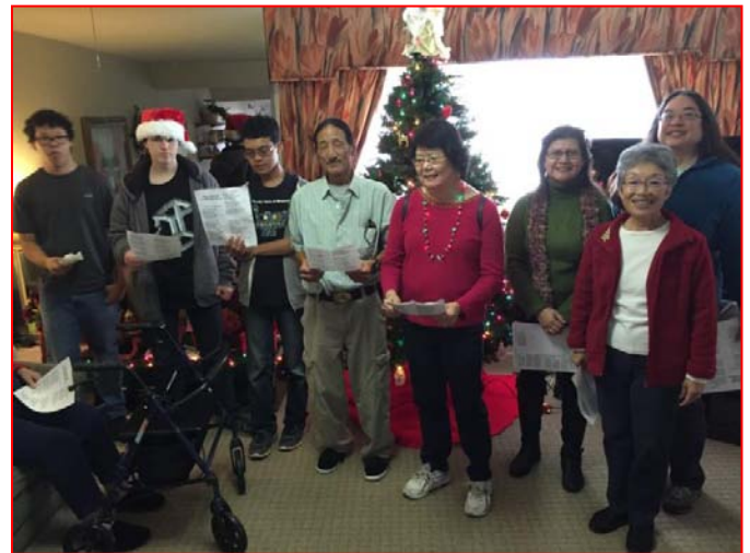
Two photos of Westview members and friends singing Christmas carols at local Senior Facilities on Saturday, December 13th.