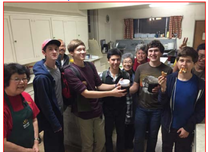
Two photos from the Salvation Army meal held on December 5th.

Westview is preparing meals for the Salvation Army every first Friday of each month (photos from December on next page under December Events). If you are interested in volunteering, please meet at Westview at 2 p.m. For the months of January and February we will be preparing the meals on January 2nd and February 6th.