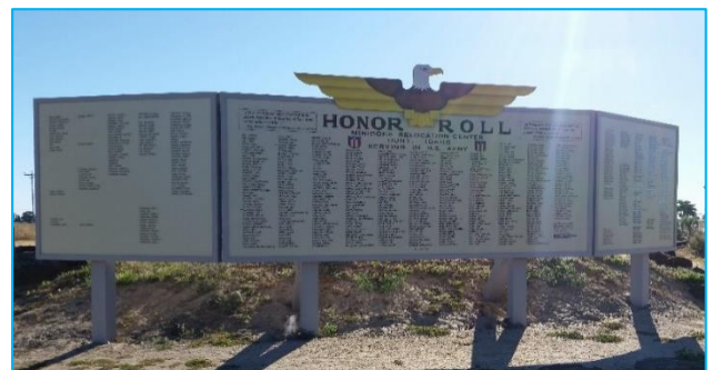
The Minidoka Honor Roll of those men and women who served gallantly in the US military during WW II.

different educational sessions (including mine!) that the pilgrims could attend. Some of the sessions included: a documentary on Min Yasui , a presentation of a graphic novel about the 442, a discussion about hapa /mixed race Nikkei, a presentation of the book "Balancing on Barbed Wire" as well as a discussion on racism.