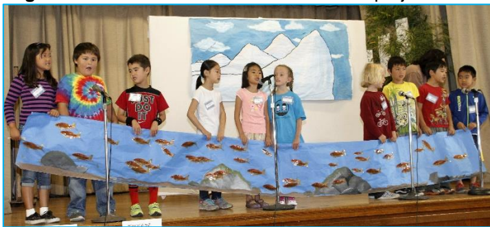
Gakko's 2 nd graders sing about fish in the ocean.