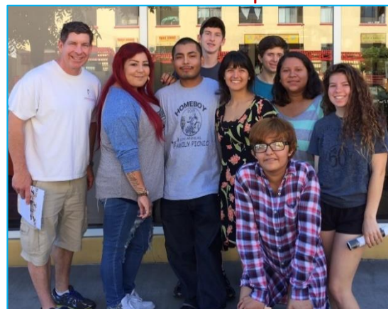
The Youth Group at Homeboy Industries with two staff members.