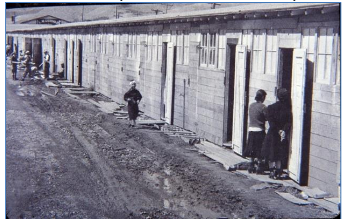
Above: Tanforan Assembly Center's horse stalls.

Arboga Assembly Center, Fresno Assembly Center, Mayer Assembly Center, Merced Assembly Center, Owens Valley Reception Center, Parker Dam Reception Center, Pinedale Assembly Center, Pomona Assembly Center, Portland Assembly Center, Puyallup Assembly Center, Sacramento Assembly Center, Salinas Assembly Center, Santa Anita Assembly Center, Stockton Assembly Center,