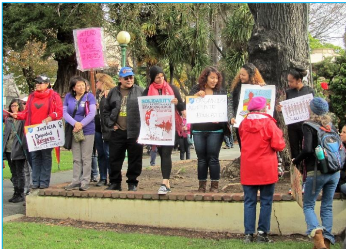
The W-SC JACL works to support causes of injustices, racial discrimination, women's and LGBTQ rights.