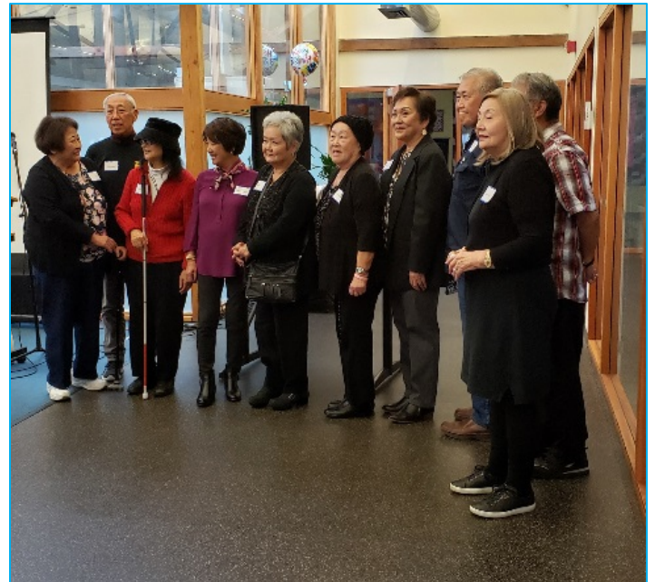
The Topaz Toddler Artists gathered in Emeryville.