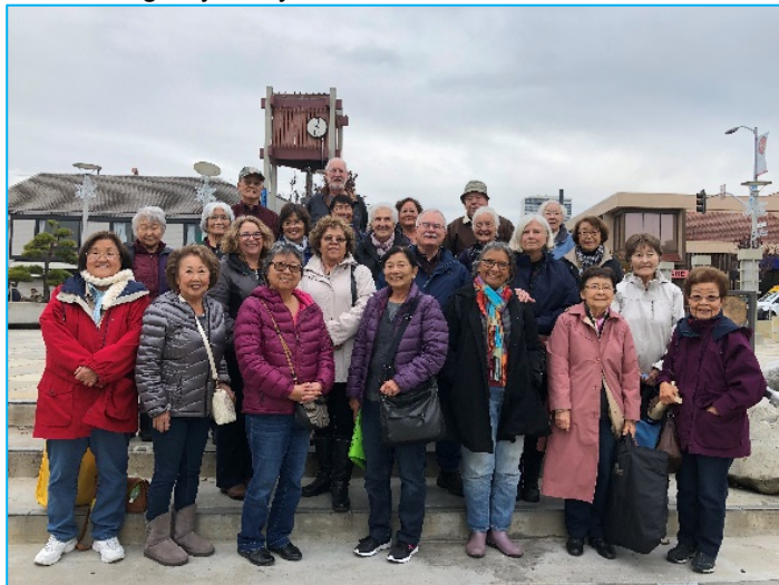
Seniors' Jolly Jaunt to SF Japantown.

day trip! Please tell your friends and family to join us next year for a relaxing day away from home.