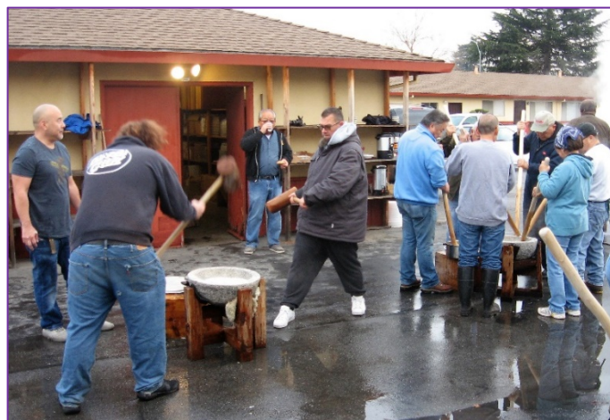
WESTVIEW PRESBYTERIAN CHIMES