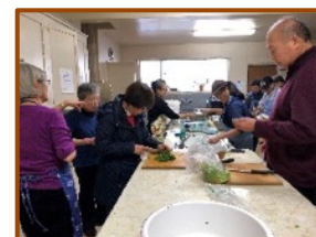
Photo at right: Members and Friends of Westview preparing the Salvation Army Meal.