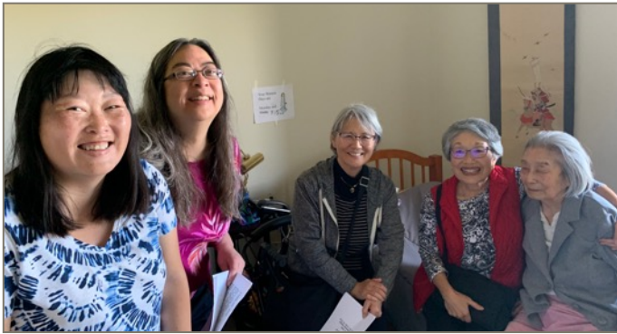
Bringing Easter and Communion to Seniors