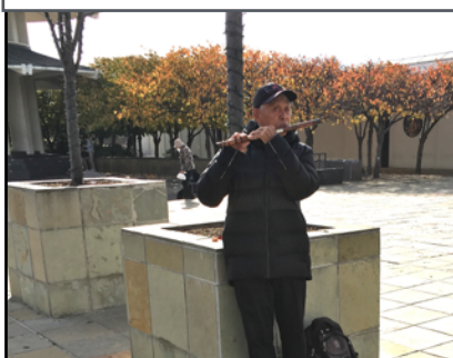
Gentleman playing soothing, beautiful music.