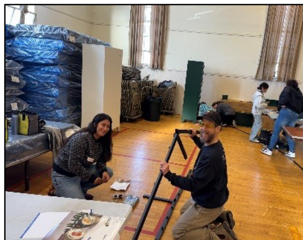
Photo above -volunteers building furniture.

And speaking of being a part of God's redeeming River of Life, Tiny Homes official name is now HOPE Village (Housing, Opportunities, Programs, Employment). The village is planned to open January 5 with 30 single rooms and 2 double rooms for a total of 34 people. Being unhoused is very traumatizing. A traumatic experience usually caused them to be unhoused: eviction, job loss, fleeing domestic violence, divorce, sickness or a severe accident often accompanied by exorbitant healthcare bills, or the difficulties of mental illness. Then once they are unhoused the trauma continues in which they are often robbed or assaulted, raped, freezing, hungry, ostracized/outcast, lose their job, lack of means to keep clean so further ostracized, self-image takes a beating, exposed to lots of drug trafficking, unwanted and often removed from their place of sleeping, and sometimes arrested. Please pray for the new residents to get the healing, yes healing, they need so they can begin their lives again and move to more permanent housing in 6-12 months. Please pray for them as they get jobs or sign up for disability, receive counseling for various issues, apply for lost or stolen documentation, reunite with family and friends, and feel loved and welcomed by the Westview Family, feeling embraced by the God who adores them!